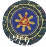
RODRIGO ROA DUTERTE President of the Philippines