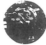
ALBERTO G. ROMULO Executive Secretary